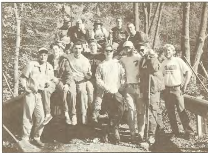
Brothers from Gamma Pi chapter at Ramapo College of New Jersey cleaned up Cameron Pond on the school's Mahwah campus. The chapter, working with members of the school's Environmental Alliance, has cleaned up the pond each semester for the past four years.

When Delta Kappa brothers aren't busy reading kiddie books, they are apparently hard at work increasing the size of their already huge chapter.